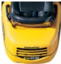
PC09-1 width 700 mm 2'4"

With an expandable undercarriage and low operating weight, the PC09-1 can pass through doorways and be loaded on freight elevators. Once onsite, the undercarriage can be expanded for added stability when excavating or performing demolition.